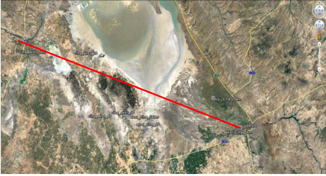
Figure. 2: Survey routes between CIHA and AKSR CORS station