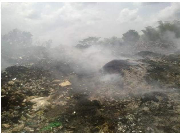
Fig No 4: Open burning of waste as a common practice which results in CO 2 emissions