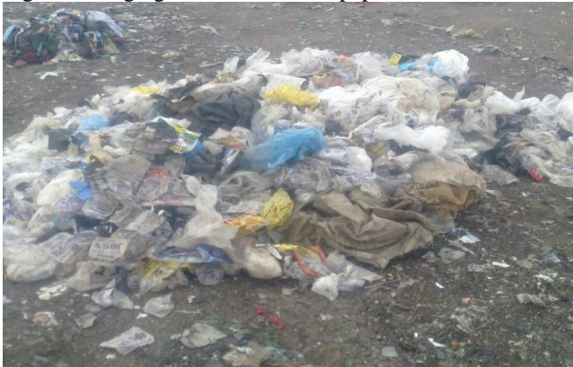
Fig No 3: Segregation of wastes in nylon and plastics