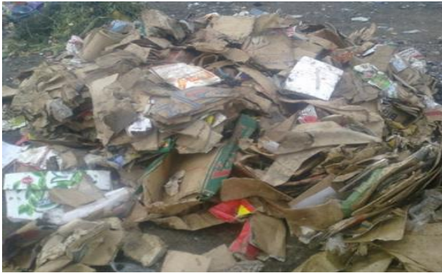
Fig No 2: Segregation of wastes in paper and carton