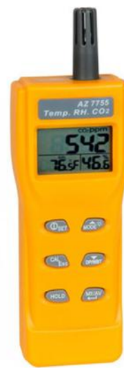
Fig No 5: P-Sense Plus CO 2 Meter AZ 7755 (USA)

At the recycling plant and dump site, carbon dioxide readings were taken at seven sampling points namely; Gate house, Roadside, Laboratory, Plastics Recycling unit, Organic Recycling Unit, Sorting Bay, Overhead Tank and Composting Unit. The meter was taken to a sampling point and placed about 80 cm from the ground. The meter was then switched on for 60 seconds after which the readings of the Carbon dioxide concentration in ppm which were displayed on the screen were recorded. The procedure was repeated thrice for each sampling point. The CO 2 monitoring was done every day for a week at 9.00a.m, 12.00 noon and 2.00 PM daily. The Temperature and Relative Humidity readings were also taken using the -Sense Plus CO 2 Meter AZ-7755 (Figure 5).