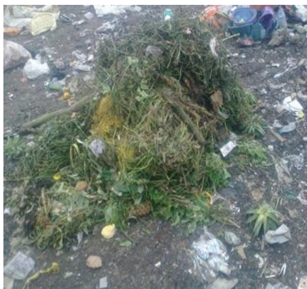
Fig No 1: Segregation of wastes in leaves

The characterization and determination of weights of the waste were carried out for a period of 12 months. The segregation waste was carried out by randomly picking a vehicle coming out of the Residential, the Markets and Roadside, once in a month. After the segregation at a central facility, the various components of the solid wastes were weighed using a 20kg capacity Camry kitchen weighing scale. The segregation of wastes into leaves; paper and carton; and nylon and plastics are shown in figures no 1, 2 and 3 respectively.. The results were computed for the number of trucks that bring in the wastes. Some of the wastes found in the facility and the opening burning of waste as a common practice which results in CO 2 emissions are shown in Figure no 4.